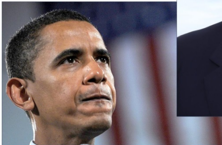
Barack Hussein ( no relation ) Obama

“Critical thinking and support for Donald Trump are incompatible.”