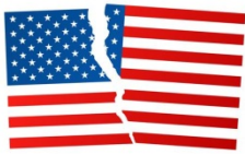
Donald ( King of the Anti-PCs ) Trump